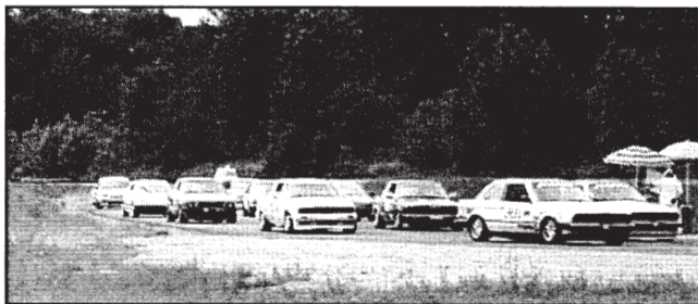
Novice Closed Wheel race was one of the highlights on Saturday's schedule.